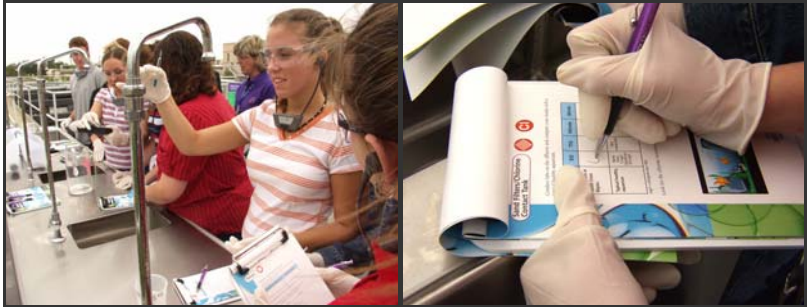
Science in Action: Pinellas County High school students test water samples as part a comprehensive program of water science and conservation education