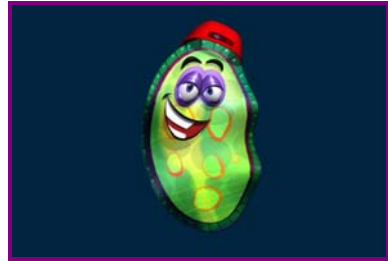
"Mike Robe" takes students deep into the process of water reclamation